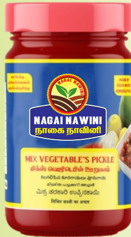
Mixed Vegetable's Pickle