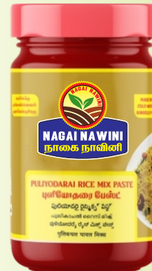
Puliodarai Rice Mix Paste