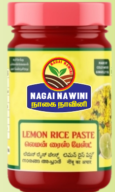
Lemon Rice Paste