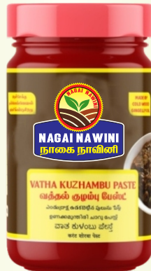
Vatha Kuzhambhu Paste